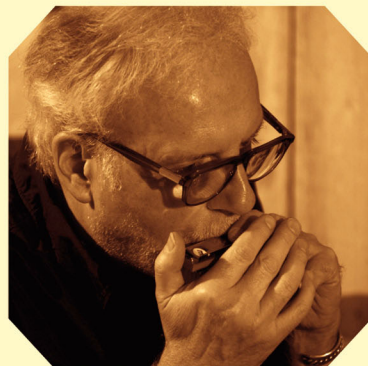
Jean Jacques Milteau